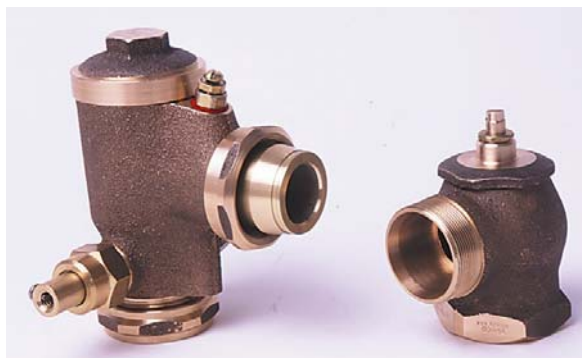
Adjustable Coupling supplied from 1967 approx.