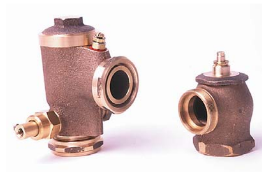
Fixed Coupling supplied before 1967