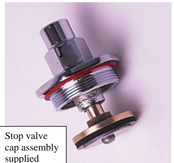
Stop valve cap assembly supplied unplated